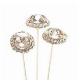
00720 Corsage Pins